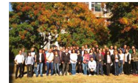
Thessaloniki, 2017.

Over the years, they allowed for sustained dialogue and rapprochement between these neighbouring countries with memory divides.