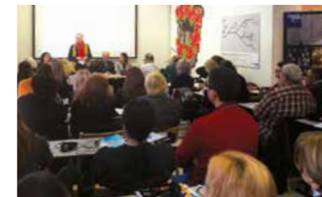
Belgrade, 2019.