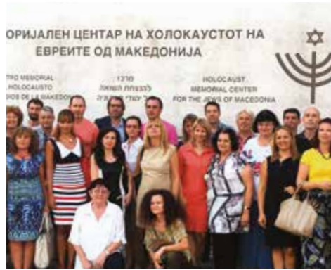
Skopje, 2017.