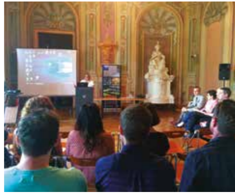
Ljubljana, 2018.

Memory controversies between Bulgaria and Northern Macedonia are centred around the question of Bulgaria's responsibility in the deportation of Jews of occupied Macedonian territories. The bilateral dialogue launched in 2017 has been extremely successful at tackling such issues. Seminars shed a light on differences of opinion on national memories and offered a common historical framework based on the choice of terminology, the latter being a key point for the issues still opposing the two countries.